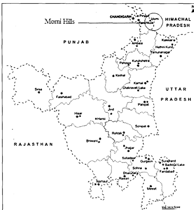
Fig.1. Map of Haryana showing Study Area (Morni Hills)

rhizome, bulb, stem, bark, latex, gum, leaves, peduncle, flower, fruit, seed, tuber, whole plant and oil are used for the treatment of various diseases. These plant parts are effective against cuts and wounds, fever, joint pain, headache, constipation, diarrhoea, eye disorders, skin ailments, cough and cold, antidote for poisonous insects, stomach disorders, urinary troubles, liver complaints, digestive problems, jaundice, asthma, bronchitis, inflammations, anamia, piles, mental disorder, abdominal pain, bone fracture, paralysis, epilepsy, impotency, general weakness etc.