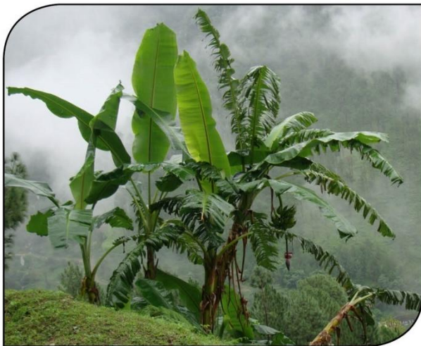
Kadalī [ Musa × paradisiaca L.]