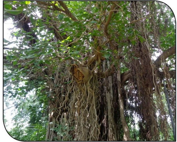
Vaṭa [ Ficus benghalensis L.]