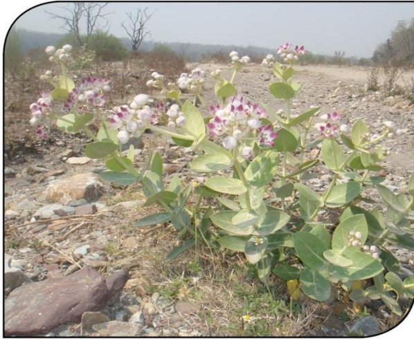
Arka [ Calotropis procera (Aiton) Dryand.]