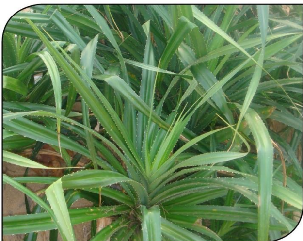
Ketakī [ Pandanus odorifer (Forssk.) Kuntze]