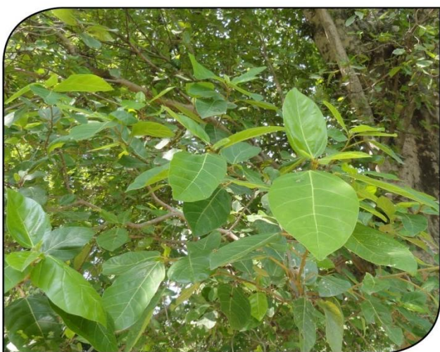
Udumbara [ Ficus racemosa L.]