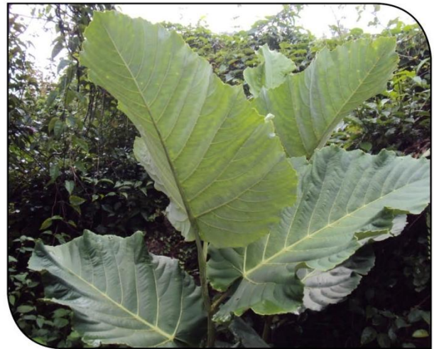
Hastikarṇī [ Leea macrophylla Roxb. ex Hornem.]