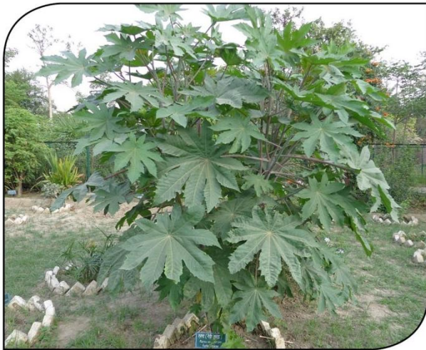
Eraṇḍa [ Ricinus communis L.]