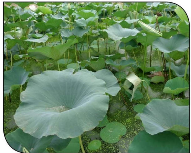
Kamala [ Nelumbo nucifera Gaertn.]