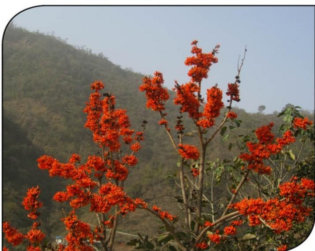
Palāśa [ Butea monosperma (Lam.) Taub.]