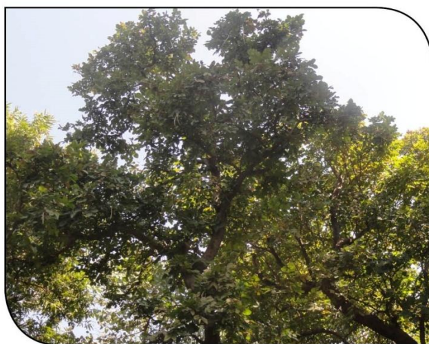
Pāṭalā [ Stereospermum chelonoides (L.f.) DC.]